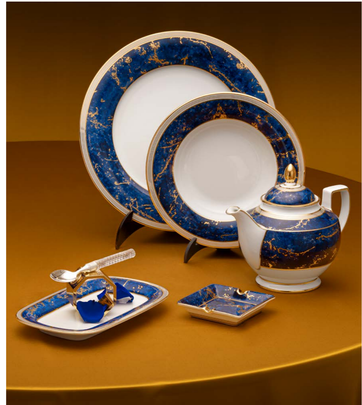
Inspired by the favourite colour of kings, the "Precious Lapis Lazuli" exclusive decor looks to the future and brings innovation to the ancient skills of authentic Florentine craftsmanship.