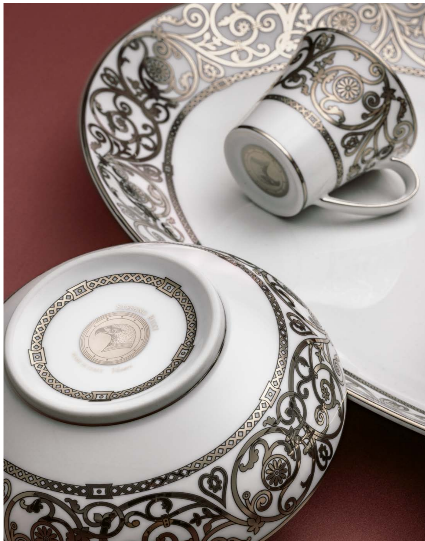
Above, details of pieces from the “Vasari” set. Each decoration is applied by hand using 100% platinum on fine porcelain. The intricate motif recalls the geometries of classic Italian gardens.