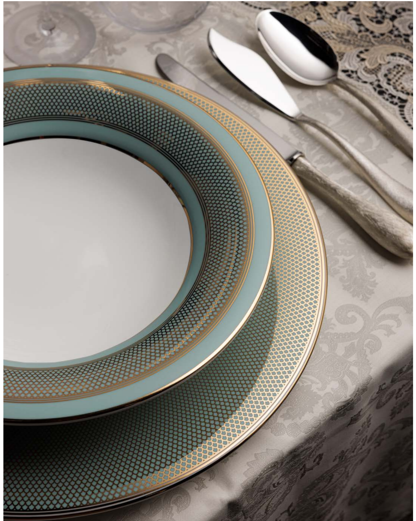
The "Ocean" geometrical decor with its modern look is a perfect fit for contemporary interiors and is often requested in the luxury yachting world.