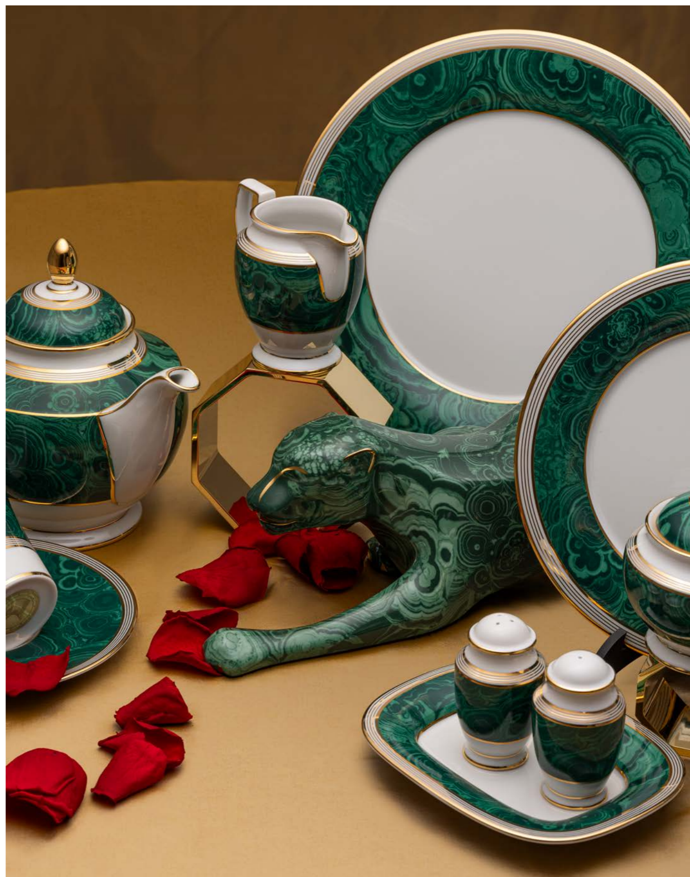
The colours of the porcelain services are carefully selected and blended with the smooth lines, as if the STEFANO RICCI table not only hosts the guests but also their dreams and desires of beauty. These stunning pieces not only symbolize luxury and high quality, but also reflect the artistic process which can take more than fifty hours of artisanal work.